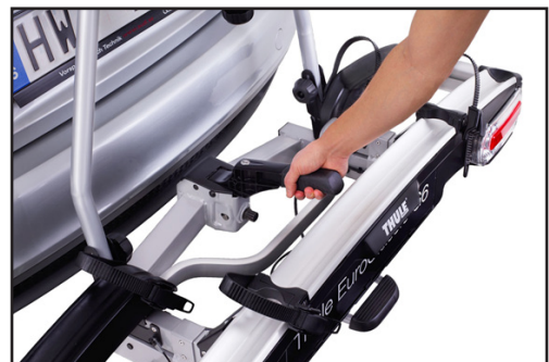
Smart towbar coupling